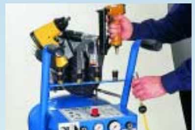
Tool storage for up to 4 tools