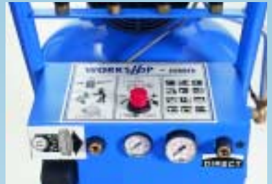
Control panel with three outlets, regulator, gauge and direct outlet