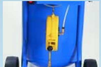
8 mtr retractable air line gets the power to where you need it