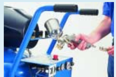
Fitted with quick connectors for ease of use