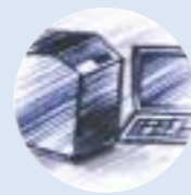
Control, regulate, monitor